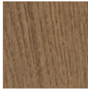
P1GW Canaletto Walnut