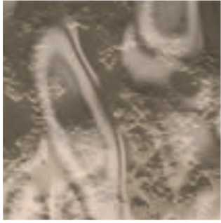
GM2 Annealed Bronze