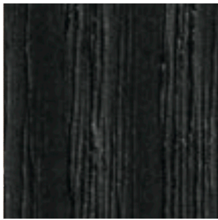
P15L Matt Black

Obtained by cutting the tree log through a mechanic process. The aesthetic features and grain pattern depend on the wood essence. Solid wood is usually varnished (finishing process) and reproduces the typical essence shades.