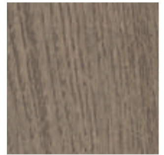
P3DW Light Walnut